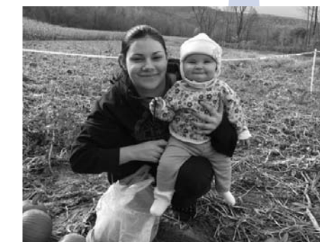
Program participants enjoy a field trip.

Parent Program is unique from other programs for young mothers because it works directly with the city’s public school system. Students who attend the Helen Berube center graduate with a degree from the local high school although it is the center that offers a full range of support to meet their educational, health and social service needs. Young mothers in the program benefit from prenatal care, child labor and delivery classes, one-on-one tutoring, college preparation, parenting course work and child care. Their children, from infants up to age two years and nine months, are cared for by professional staff at the center.