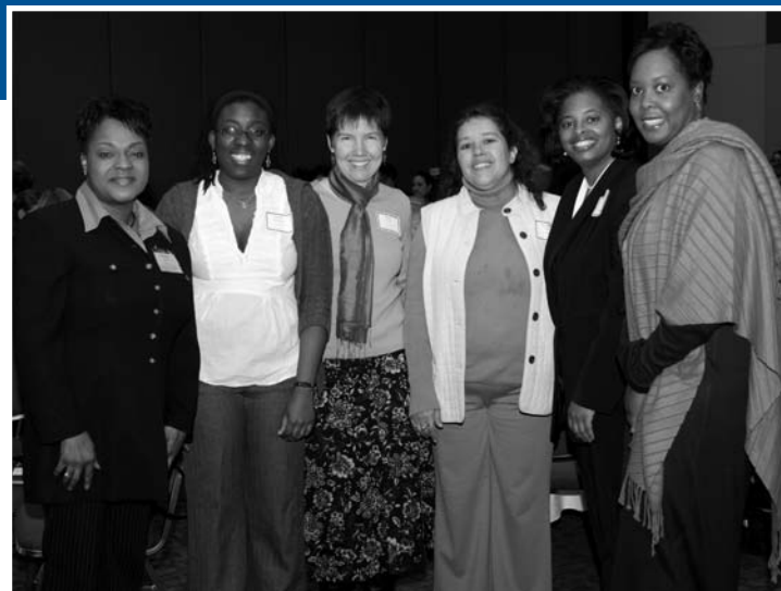
Conference attendees enjoy networking.