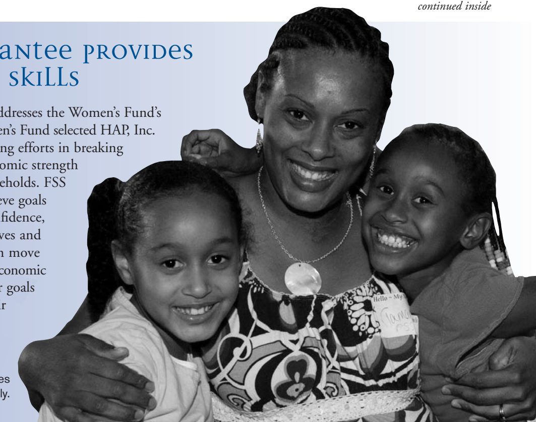
2008 HAP, Inc. graduate celebrates success with her family.

HAP, Inc's Family Sufficiency Program addresses the Women's Fund's focus area of economic justice. The Women's Fund selected HAP, Inc. as a grantee in 2008 because of their strong efforts in breaking the cycle of poverty and developing economic strength among low-income female heads of households. FSS counselors help participants set and achieve goals that build their financial literacy, self-confidence, job skills and ability to support themselves and their children. Graduates of the program move from dependence on public assistance to economic self-sufficiency and go on to achieve their goals of purchasing their own car, funding their education or buying a home for their children to grow in.